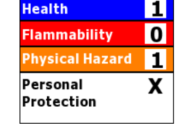
NFPA SCALE (0-4)